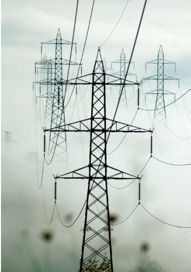
Licensed to American Diversified Energy, LLC