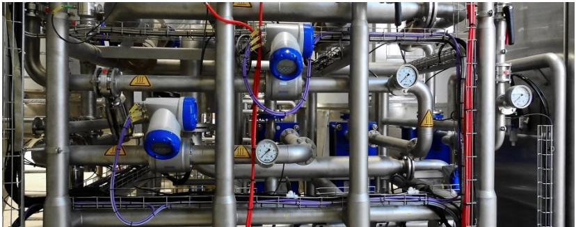
Pexels photo 371938