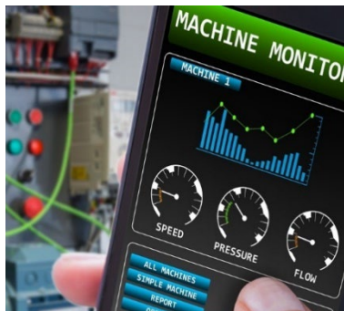
Licensed to American Diversified Energy, LLC