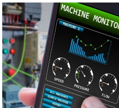
Licensed to American Diversified Energy, LLC